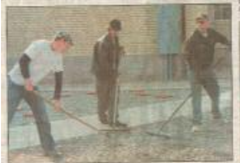
WILLING WORKERS LEVEL GRAVEL under Delta Opportunity School. "The school gives every child a chance to succeed," said the staff members of Delta Opportunity School. "Students find an opportunity to demonstrate their sense of responsibility while working on a worthwhile project with the Altrusans, their families and members of ASTREA."