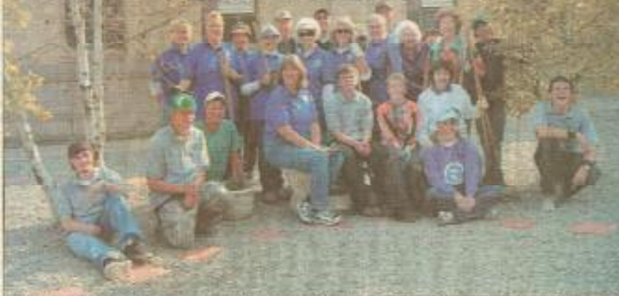
ABOUT 29 ALTRUSANS AND their parents, wives, siblings, AVIDA members, DGS students and staff to complete a landscaping project at Delta Opportunity School Saturday, Oct. 27. The alternative high school is located in the old shop at the former Delta Middle High School. The school serves at-risk students in grades 9-12.

This article appeared in the Delta County Independent, The Back Page , on Wednesday, October 31. Thanks to all Altrusans who helped make this a success!