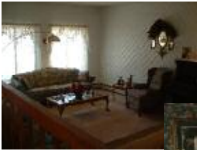
641 Cypress Wood Lane