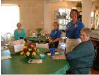
Some of our members working at the Garden Center Bistro